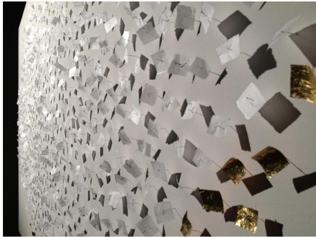
Tell Me 2004 – 2014, Detail.

This event is free and open to the public.