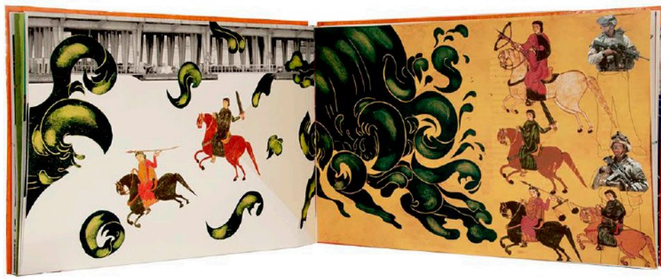
Barbara Milman, Apocalypse , 2015, Artist book of inkjet prints, linocuts, collage, and linen thread, Edition: Unique, Printed and published by the artist.

ON VIEW: NOVEMBER 19, 2015 - JANUARY 16, 2016