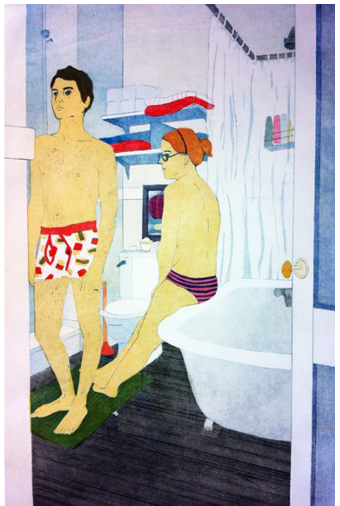
Crystal A. Johnson, Wickenden Street III , 2015, Soft ground etching and drypoint, Edition: 8, Printed and published by the artist.

Join the conversation! Follow @IPCNY on Twitter, Instagram, and Facebook ( facebook.com/internationalprintcenter ).