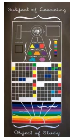
Top: C'mon Language , 2013 (Portland Museum for Contemporary Art); Schema for K , 2015 (REDCAT Los Angeles). Bottom: Subject of Learning / Object of Study , 2010 (Blanton Museum of Art).